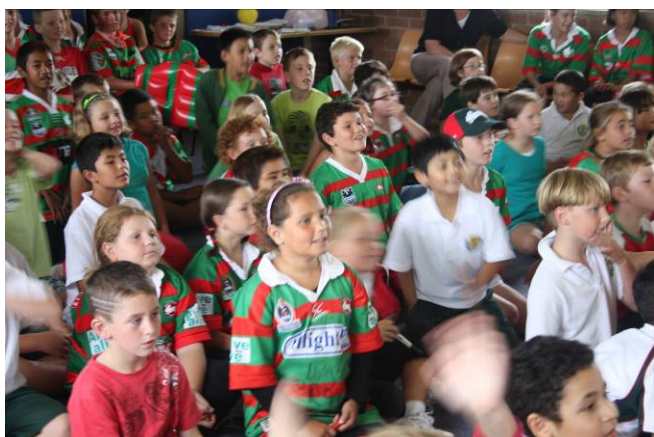
Red and Green Day earlier in the year!!

To celebrate the end of the football season and help the Year 6 to raise funds. The school will be holding a Grand Final Mufti on Friday 2 nd of October . Students will be allowed to come to school in the uniform of either a team they follow or a team they play in. The "fine" for coming to school out of uniform is a gold coin donation going towards the Year 6 farewell. Let's hope we see lots of students showing off their teams on this special day.