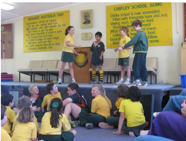
4S explain how machines work.