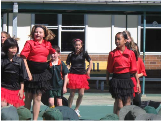
The dance group performing..