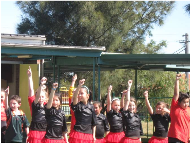
A special assembly for our Senior Dance Group.

We are fast approaching the end of term 3 and there is much to do. Please remember to check your child's bag regularly for notes as times/dates etc listed in this Chifley Chatter may change.