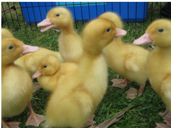
Some of the recent visitors to 1/2S!!